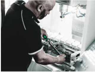
Click-Torque Wrench series