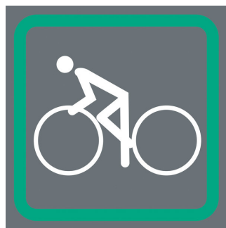
Compact screwdriving tool set for bicycle applications, also for mobile use.