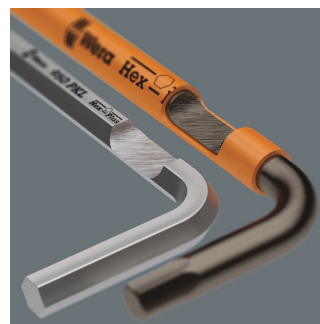
L-keys made from circular material with plastic sleeve for use on bicycles. The plastic sleeve makes working comfortable even at low temperatures and is easy on the fingers. All L-keys are easily accessible due to their colour coding and size markings. For hexagon and TORX® screws.