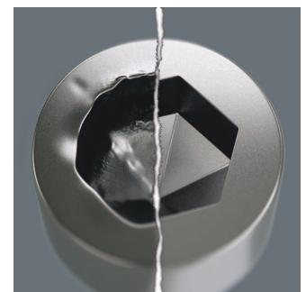
Hexagon screws can endure a problem because the contact surfaces delivering the power from the conventional tool, is transferred to the screw via very small surface areas. The consequence: the screw can become damaged (rounding out). Hex-Plus tools have a greater contact surface that prevents this from happening! At the same time, as much as 20 % more torque can be applied. Good to know: Hex-Plus tools fit into every standard hexagon socket screw!