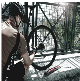
For the road and the workshop